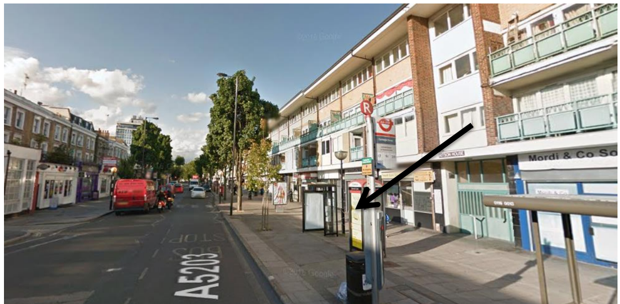
Image 3 : View of existing BT phone box looking north along Caledonian Road towards Copenhagen Street