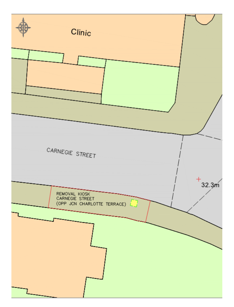
Image 7: Site plan showing the location of the additional 2 phone boxes which would be removed prior to commencement of the works.